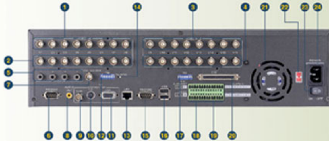
PowerPlex eDR1680 (Back Panel)