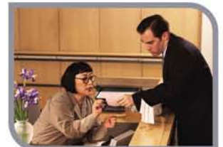
Bank and Office