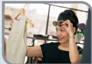
Store and Mall