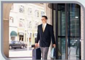
Building and Entrance