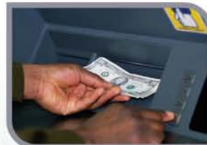
Cash Vault Operation