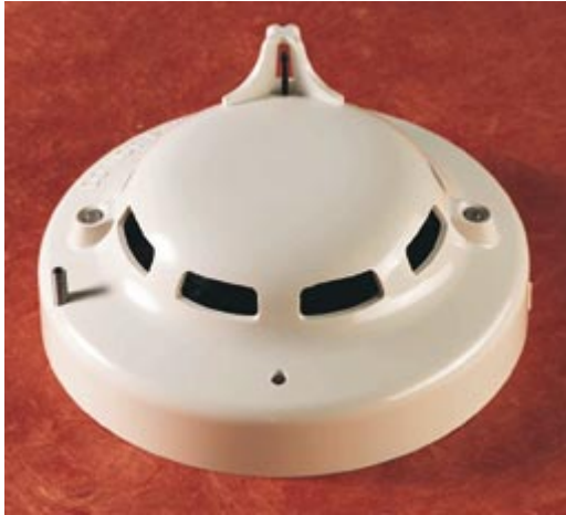
Shown without base.