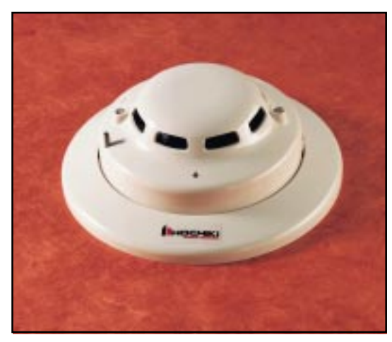
Shown with Trim Ring.