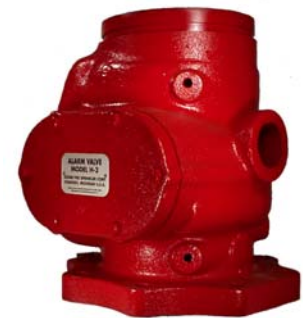
MODEL H-3 ALARM CHECK VALVE