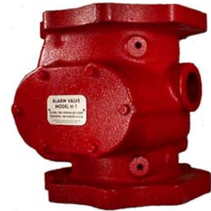
MODEL H-1 ALARM CHECK VALVE

Rubber parts are of selective materials which have good abrasive resistance and long life expectancy in terms of resiliency.