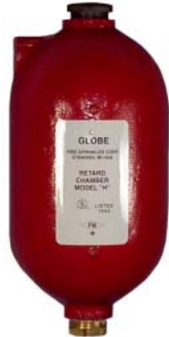
MODEL H RETARD CHAMBER

All interior operating parts are machined from highly corrosive-resistant alloys, each having high strength and good wear resistance.