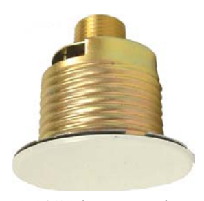
2 3/4" diameter plate