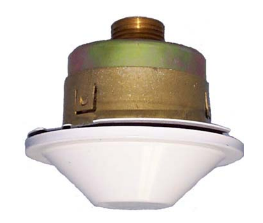
WHITE CONCEALED PENDENT