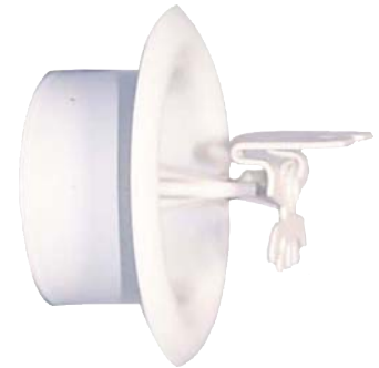
MODEL GL5631 RESIDENTIAL HORIZONTAL SIDEWALL