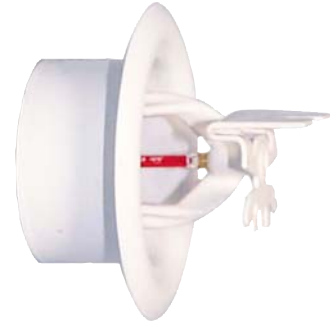
MODELS GL4230 & GL5630 RESIDENTIAL HORIZONTAL SIDEWALL

The heart of Globe's GL Series sprinkler proven actuating assembly is a hermetically sealed frangible glass ampule that contains a precisely measured amount of fluid. When heat is absorbed, the liquid within the bulb expands increasing the internal pressure. At the prescribed temperature the internal pressure within the ampule exceeds the strength of the glass causing the glass to shatter. This results in water discharge which is distributed in an approved pattern depending upon the deflector style used.