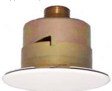
WHITE CONCEALED PENDENT