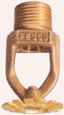
Open Pendant Type

As the all-time open head without heat sensing part suitable for deluge system, Paradise Open type sprinkler is widely used for factory, special industrial facility, underground shopping area, and hazardous material storage.