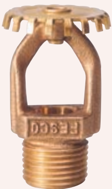
Open Upright Type