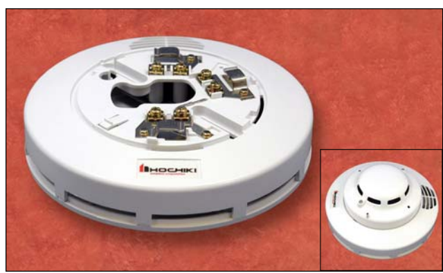
Shown without sensor